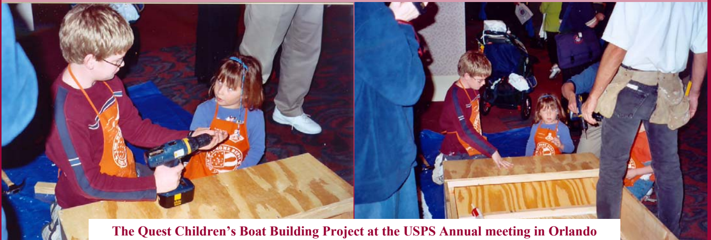
The Quest Children's Boat Building Project at the USPS Annual meeting in Orlando

Costs: Book $25.00, Supplies (protractor, divider-$10.00)